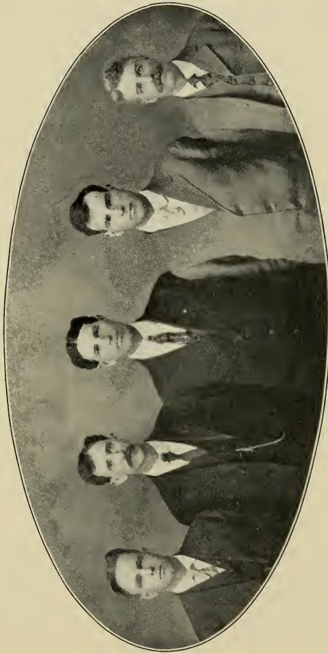
"THE FOUNDERS OF THE FIRST ARCTIC ALASKAN EDUCATIONAL EXHIBITION."